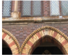
FORMER WESLEYAN CHURCH AND MODEL SUNDAY SCHOOL SOHE 2008