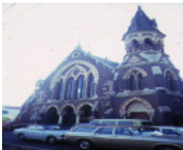
1 former wesleyan church & model school sydney road brunswick front view