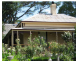
FRIEDENSRUH SOHE 2008