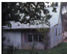
friedensruh waldau court doncaster packing shed may1981