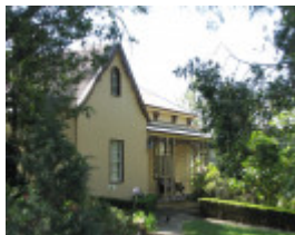
FRIEDENSRUH SOHE 2008