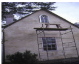
1 friedensruh waldau court doncaster side view house