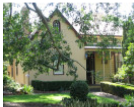
FRIEDENSRUH SOHE 2008