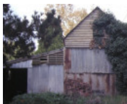
friedensruh waldau court doncaster stable may1981