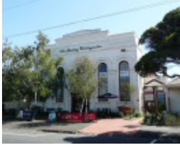
WINTERGARDEN SOHE 2008