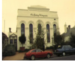
1 congregational church mckillop street geelong front view jun1995