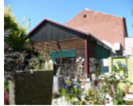
WINTERGARDEN SOHE 2008