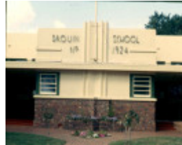
Primary School Number 1924 Drouin Front