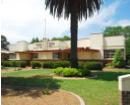
PRIMARY SCHOOL NO. 1924 SOHE 2008