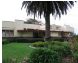
H1627 Drouin Primary School Everett building front elevation from west 2007