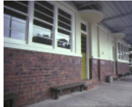
primary school number 1924 drouin class room entrance mar1985