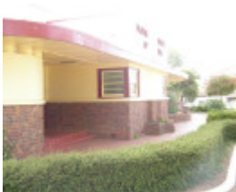
h01627 primary school no 1924 princes hwy drouin front