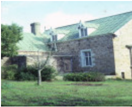
coriyule homestead mcdermott road drysdale view of top floor