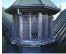
coriyule homestead mcdermott road drysdale enclosed glass room on roof