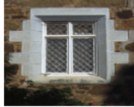
coriyule homestead mcdermott road drysdale detail of stone framed window