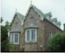
1 coriyule homestead drysdale side view of homestead