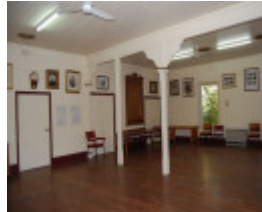
H0550 supper room briagolongMI