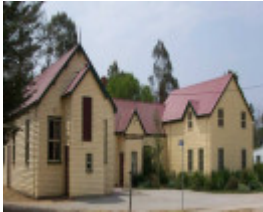
H0550 Briagolong Mechanics Institute