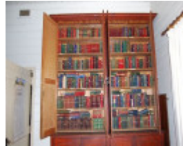
H0550 Briag library