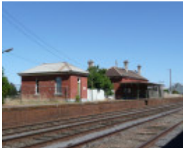
DUNOLLY RAILWAY STATION SOHE 2008