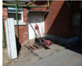
DUNOLLY RAILWAY STATION SOHE 2008