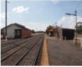
H1670 DUNOLLY RAILWAY STATION LHA 2015 2.JPG