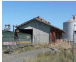
DUNOLLY RAILWAY STATION SOHE 2008