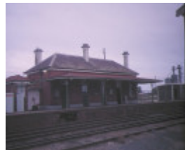
1 dunolly railway station trackside view may1995