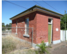
DUNOLLY RAILWAY STATION SOHE 2008