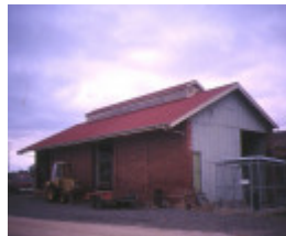
dunolly railway station goods shed may1995