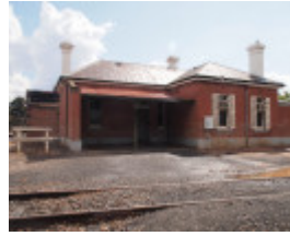
H1670 DUNOLLY RAILWAY STATION LHA 2015 3.JPG