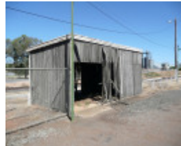
DUNOLLY RAILWAY STATION SOHE 2008