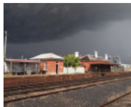
H1670 DUNOLLY RAILWAY STATION LHA 2015 1.JPG