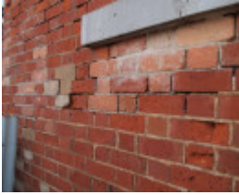
H1670 DUNOLLY RAILWAY STATION LHA 2015 5.JPG