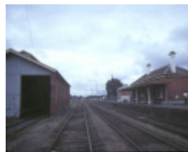
dunolly railway station track view aug1984