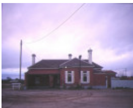
dunolly railway station roadside elevation may1995