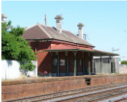
DUNOLLY RAILWAY STATION SOHE 2008