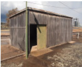
H1670 DUNOLLY RAILWAY STATION LHA 2015 8.JPG