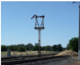
DUNOLLY RAILWAY STATION SOHE 2008