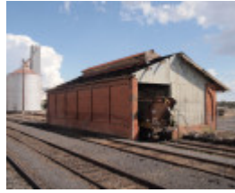
H1670 DUNOLLY RAILWAY STATION LHA 2015 4.JPG