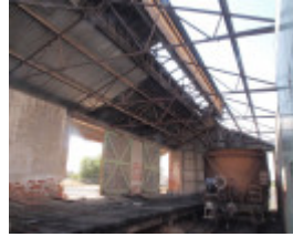
H1670 DUNOLLY RAILWAY STATION LHA 2015 6.JPG