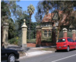
FORMER NORTH PARK SOHE 2008