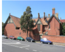
FORMER NORTH PARK SOHE 2008