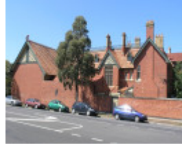
FORMER NORTH PARK SOHE 2008