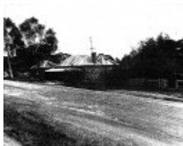
Clark Street Cottages