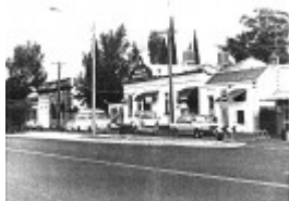
Buildings on Eaglehawk Road, California Gully