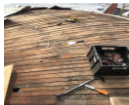
During Photographs - Reference F3883 2015