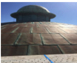
Before Photographs - Reference F3883 2014