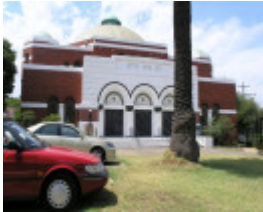
ST KILDA HEBREW CONGREGATION SYNAGOGUE SOHE 2008