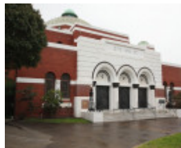
Before Photographs - Reference F3883 2014