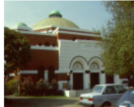
H01968 1 stkilda synagogue