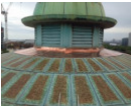
After Photographs - Reference F3883 2016