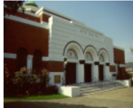
H01968 stkilda synagogue