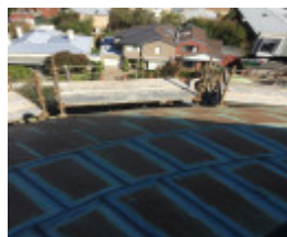
During Photographs - Reference F3883 2015