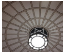
After Photographs - Reference F3883 2016