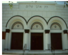
H01968 stkilda synagogue doors