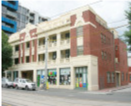
FORMER NO.3 CARLTON FIRE STATION SOHE 2008