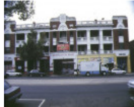
1 former number 3 carlton fire station swanston street carlton front view