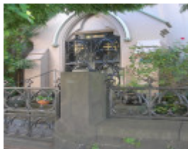
NEW TEMPLE CHURCH SOHE 2008