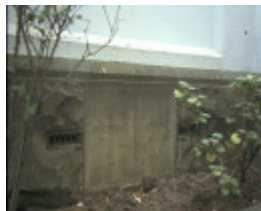
new temple church north east corner of albert street east melbourne memorial stone oct1990