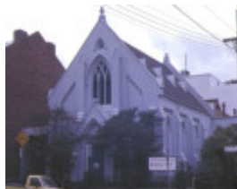
1 new temple church north east corner of albert street east melbourne frotn view sep1981