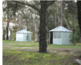
Former Corindhap State School No.1906