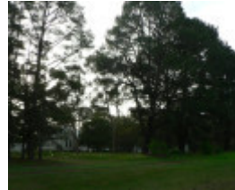
Former Corindhap State School No.1906