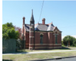
ST ALBANS HOMESTEAD GATE LODGE SOHE 2008