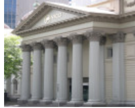
FORMER BAPTIST CHURCH HOUSE SOHE 2008