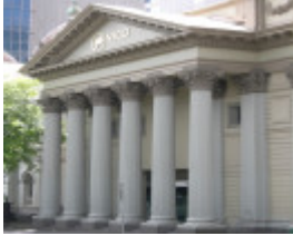
FORMER BAPTIST CHURCH HOUSE SOHE 2008