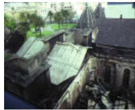
former baptist church house ext roof