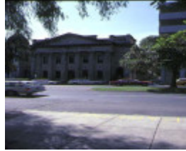
1 former baptist church house ext front