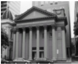
former baptist church house front elevation