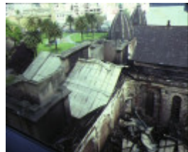
former baptist church house ext roof