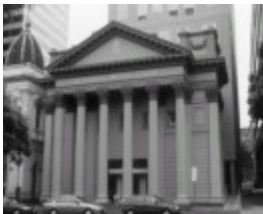
former baptist church house front elevation