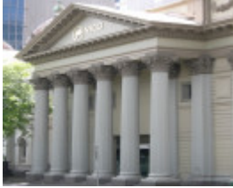
FORMER BAPTIST CHURCH HOUSE SOHE 2008