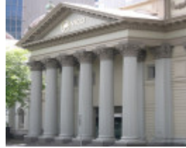
FORMER BAPTIST CHURCH HOUSE SOHE 2008