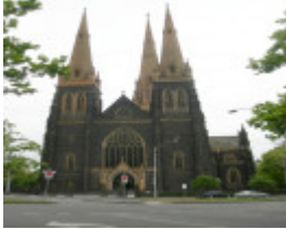
ST PATRICKS CATHEDRAL PRECINCT SOHE 2008