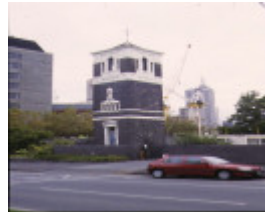
st patricks cathedral east melb college tower