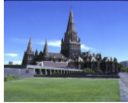
1 st patricks cathedral east melb external view