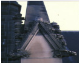
st patricks cathedral east melb external detail