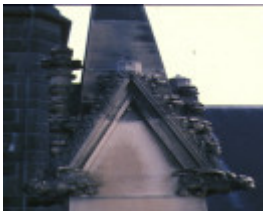
st patricks cathedral east melb external detail