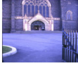
st patricks cathedral east melb external entrance