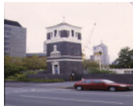
st patricks cathedral east melb college tower