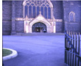
st patricks cathedral east melb external entrance