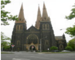
ST PATRICKS CATHEDRAL PRECINCT SOHE 2008