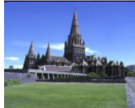
1 st patricks cathedral east melb external view