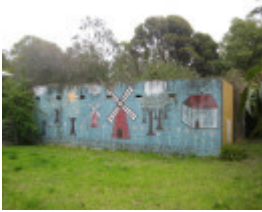
Former Maribyrnong Migrant Hostel Sept 2008 Dutch Mural