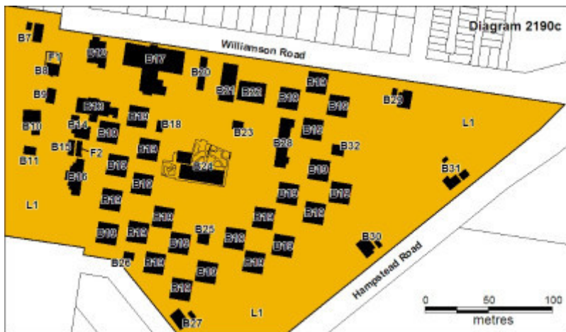
Former Maribyrnong Migrant Hostel Sept 2008 m/z Plan C