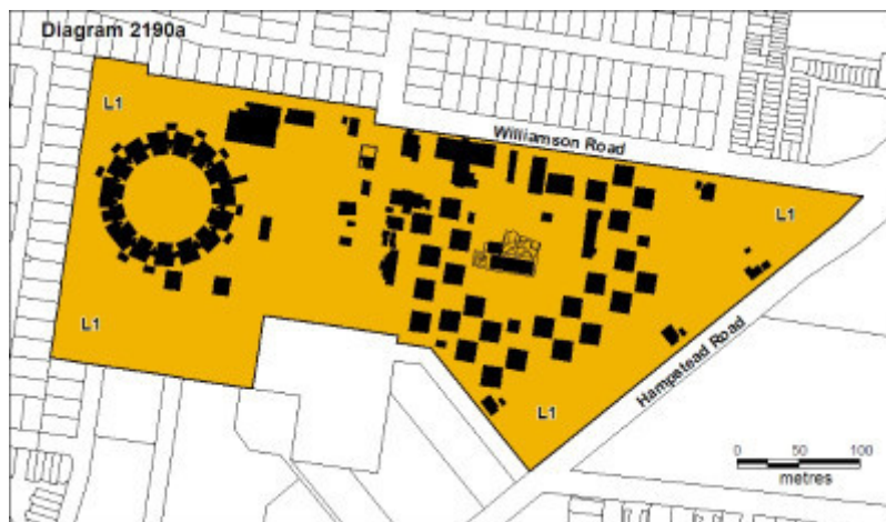
Former Maribyrnong Migrant Hostel Sept 2008 mz Plan A