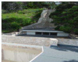
ILYUKA LIME KILN/BATHING BOX SOHE 2008