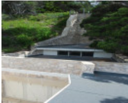
ILYUKA LIME KILN/BATHING BOX SOHE 2008