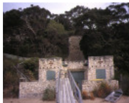
1 ilyuka lime kiln bathing box point king road portsea front view