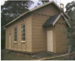
1 fryerstown methodist church hall heron street fryerstown entrance 1997