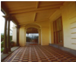
braemar george street east melbourne verandah from east jan 2000