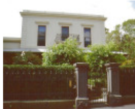
1 braemar gerorge street eat melbourne main facade jan 2000