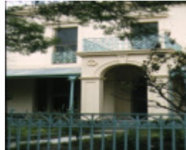
Braemar George Street East Melbourne Exterior Entrance