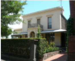
BRAEMAR SOHE 2008