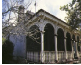
1 Lauriston high street maldon front verandah sep1997