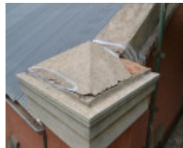
Before Photograph - Reference F3878 2014