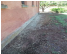
Before Photograph - Reference F3878 2014