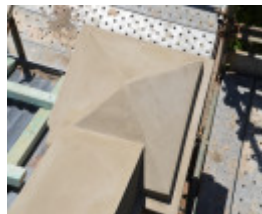
After Photograph - Reference F3878 2016