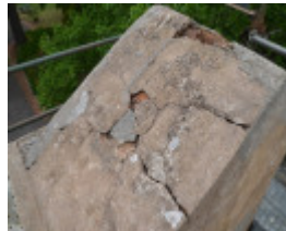
Before Photograph - Reference F3878 2014