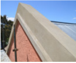
After Photograph - Reference F3878 2016