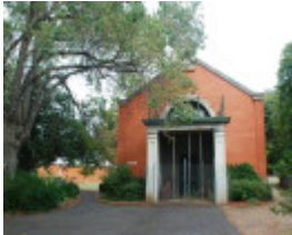
FORMER MARKET HALL AND ROYAL OAKS SOHE 2008