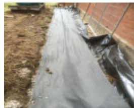
During Photograph - Reference F3878 2015