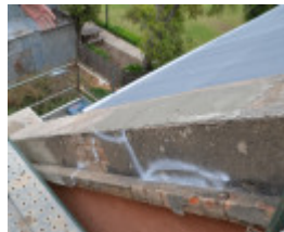
Before Photograph - Reference F3878 2014