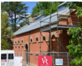
After Photograph - Reference F3878 2016