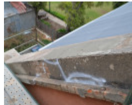
Before Photograph - Reference F3878 2014