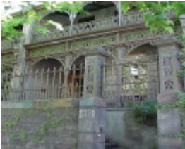
1 tasma terrace parliament place east melbourne entrance view oct1999