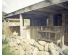
h00979 ziebells farm gardenia st thomastown drying shed east end she project 2003