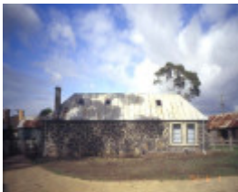
h00979 ziebells farm gardenia st thomastown view of farmhouse she project 2003