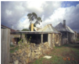
h00979 ziebells farm gardenia st thomastown drying shed she project 2003