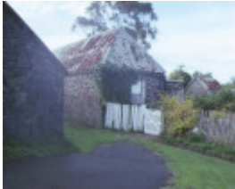
1 ziebell's farmhouse gardenia road thomastown front view