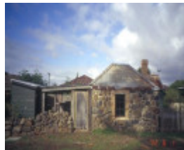
h00979 ziebells farm gardenia st thomastown smokehouse laundry outbuilding she project 2003