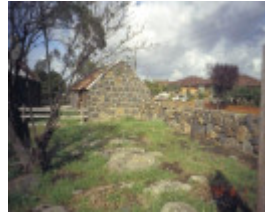
h00979 ziebells farm gardenia st thomastown barn outbuilding north end she project 2003