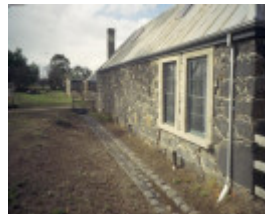
h00979 ziebells farm gardenia st thomastown farmhouse north wall stone gutter she project 2003