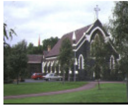
1 uniting church second wesleyan methodist chapel sydney road coburg front view