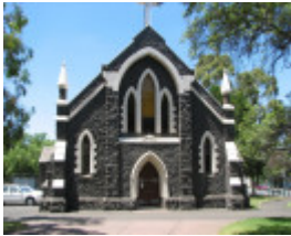
UNITING CHURCH SECOND WESLEYAN METHODIST CHAPEL SOHE 2008