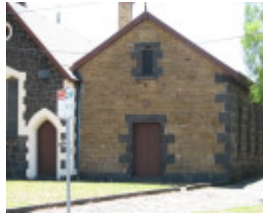
UNITING CHURCH SECOND WESLEYAN METHODIST CHAPEL SOHE 2008