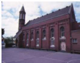
1 st john's church victoria parade east melbourne side view nov1988