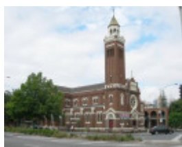
ST JOHNS CHURCH SOHE 2008