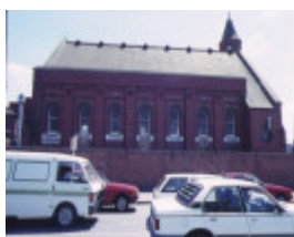
st john's church victoria parade east melbourne hoddle street side view nov1988