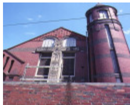
st john's church victoria parade east melbourne detail of runic cross