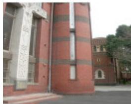
ST JOHNS CHURCH SOHE 2008