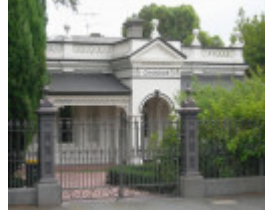
CHANDOS SOHE 2008