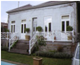
chandos 44 hotham street east melbourne rear view post1985