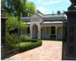
CHANDOS SOHE 2008