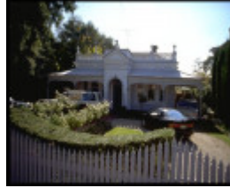
h00535 1 chandos 001