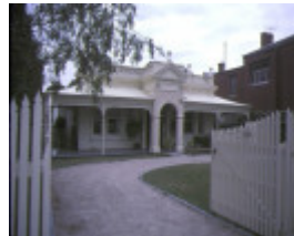
h00535 chandos 44 hotham street east melbourne front view feb1985