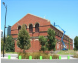
QUEENS WAREHOUSE SOHE 2008