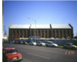
1 queens warehouse blyth street west melbourne side view feb1996