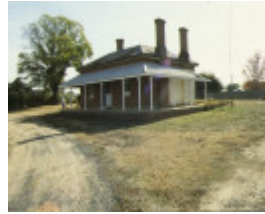
h00986 old1 former police superintendent s residence lislie street stawell front view may1993