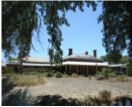
FORMER POLICE SUPERINTENDENT'S RESIDENCE SOHE 2008