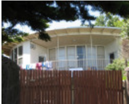
ROUND HOUSE SOHE 2008