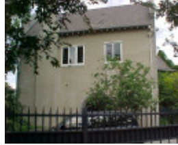
Wyalla Monaro Road Kooyong West Wing November 2001