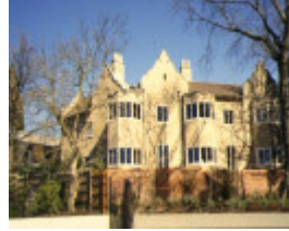
Wyalla Monaro Road Kooyong Exterior View August 1994