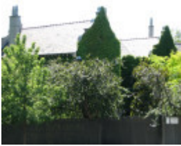
THANES SOHE 2008