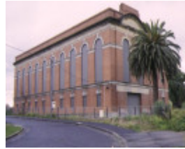
1 railway sub station off newmarket street flemington front view