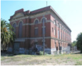
RAILWAY SUB-STATION SOHE 2008