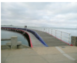
EASTERN BEACH BATHING COMPLEX AND RESERVE SOHE 2008