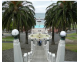
EASTERN BEACH BATHING COMPLEX AND RESERVE SOHE 2008