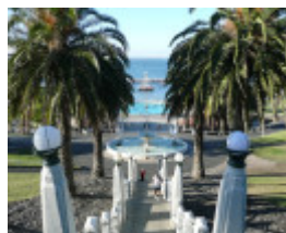
EASTERN BEACH BATHING COMPLEX AND RESERVE SOHE 2008