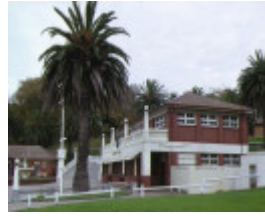
1 eastern beach bathing complex & reserve geelong cafe side view