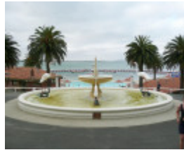
EASTERN BEACH BATHING COMPLEX AND RESERVE SOHE 2008