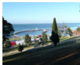
EASTERN BEACH BATHING COMPLEX AND RESERVE SOHE 2008