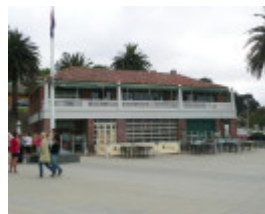
EASTERN BEACH BATHING COMPLEX AND RESERVE SOHE 2008