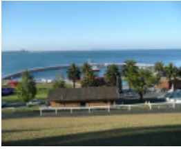
EASTERN BEACH BATHING COMPLEX AND RESERVE SOHE 2008