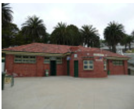
EASTERN BEACH BATHING COMPLEX AND RESERVE SOHE 2008