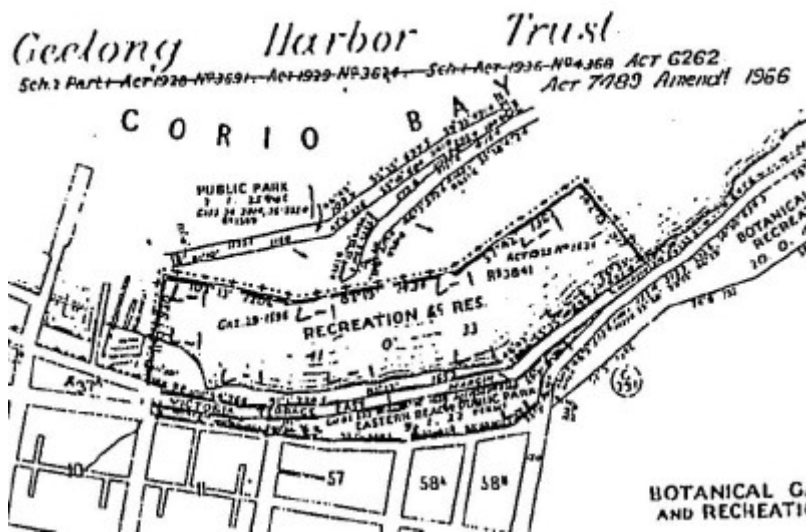
H0929 eastern beach extent