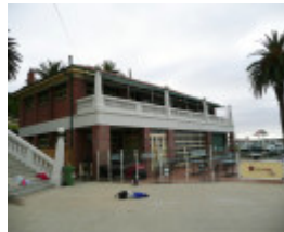
EASTERN BEACH BATHING COMPLEX AND RESERVE SOHE 2008