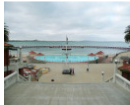
EASTERN BEACH BATHING COMPLEX AND RESERVE SOHE 2008