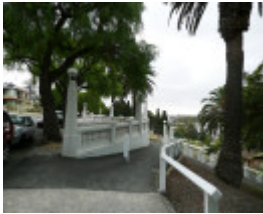
EASTERN BEACH BATHING COMPLEX AND RESERVE SOHE 2008