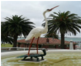
EASTERN BEACH BATHING COMPLEX AND RESERVE SOHE 2008