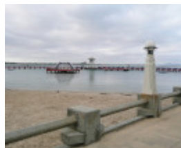
EASTERN BEACH BATHING COMPLEX AND RESERVE SOHE 2008