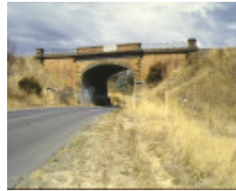
CHEWTON RAILWAY PRECINCT (MURRAY VALLEY RAILWAY, MELBOURNE TO ECHUCA) SOHE 2008