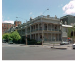
1 burlington terrace 400 384 albert street east melbourne street view oct1999