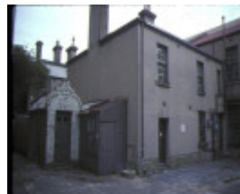
Burlington Terrace 27 Lansdowne Street East Melbourne Exterior Rear