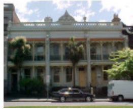
burlington terrace 400 396 albert street east melbourne front view oct1999