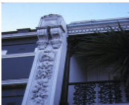
Burlington Terrace 25 Lansdowne Street East Melbourne Detail Front