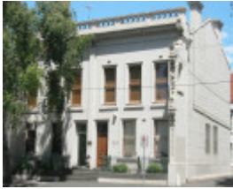
BURLINGTON TERRACE SOHE 2008