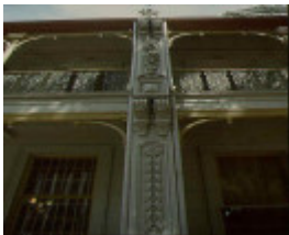
burlington terrace party wall