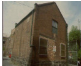
burlington terrace stables rear of 400 albert street