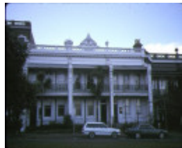
Burlington Terrace 23 Lansdowne Street East Melbourne Exterior Front