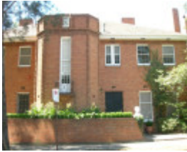
VICE CHANCELLOR'S HOUSE SOHE 2008