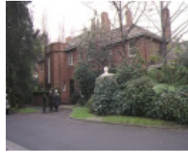
1 vice chancellors house university of melbourne parkville front view