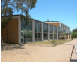
BEAUREPAIRE CENTRE SOHE 2008