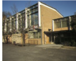
1 beaurepair centre university of melbourne parkville exterior view jul1993