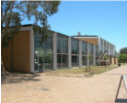
BEAUREPAIRE CENTRE SOHE 2008