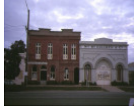
1 former permewan wright offices echuca front view