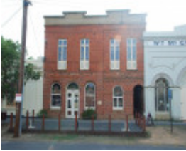
FORMER PERMEWAN WRIGHT OFFICES SOHE 2008