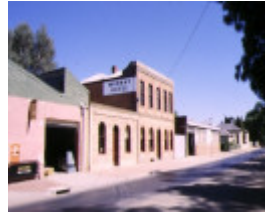
1 former murray hotel echuca streetscape 1998