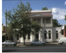
1 national bank benalla front view mar1994