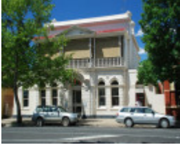
NATIONAL BANK SOHE 2008