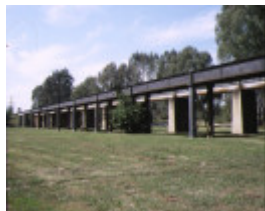
1 rail bridge benalla length of bridge apr1994