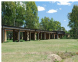
RAIL BRIDGE SOHE 2008