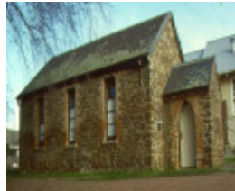
H01970 1 st johns the less east brighton 2001