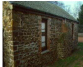
H01970 st johns the less east brighton south elevation 2001