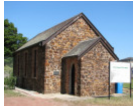
FORMER ST JOHN'S THE LESS ANGLICAN CHURCH AND SCHOOLROOM SOHE 2008