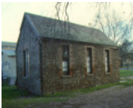
H01970 st johns the less east brighton north elevation 2001