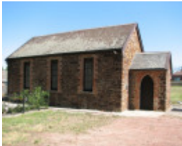
FORMER ST JOHN'S THE LESS ANGLICAN CHURCH AND SCHOOLROOM SOHE 2008