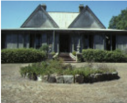
1 spray farm drysdale front view mar1989