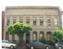
TERRACE SOHE 2008