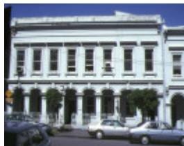
1 terrace 14 & 18 morrison place east melbourne front view nov1990