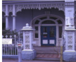
terrace 20 & 22 morrison place east melbourne front entrance sep1981