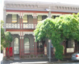
TERRACE SOHE 2008