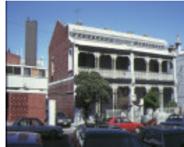
1 terrace 20 & 22 morrison place east melbourne front view nov1990