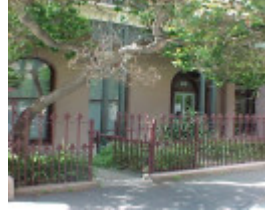
terrace 22 morrison place east melbourne front elevation oct1999