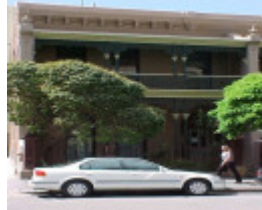
terrace 22 morrison place east melbourne entrance detail oct1999