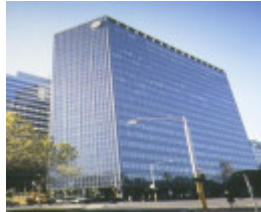
ICI House Nicholson Street East Melbourne Front Elevation