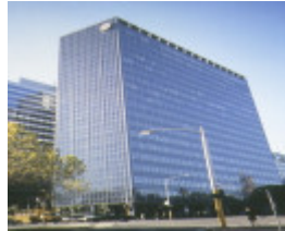
ICI House Nicholson Street East Melbourne Front Elevation