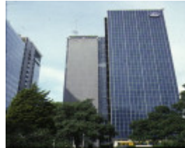
ici house nicholson street east Melbourne front view