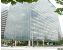
ICI HOUSE SOHE 2008