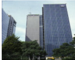
ici house nicholson street east Melbourne front view