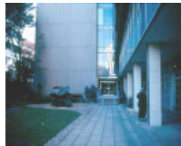
ICI House Nicholson Street East Melbourne Garden Entrance