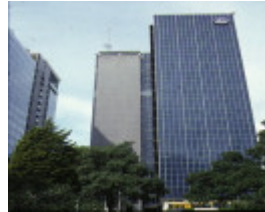
ici house nicholson street east Melbourne front view