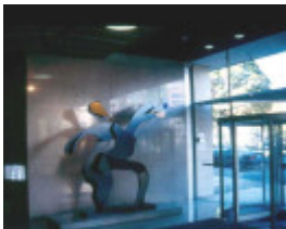
ICI House Nicholson Street East Melbourne Foyer Joie De Vivre