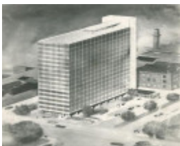
ICI Architects Drawing For ICI House Source BSM.JPG