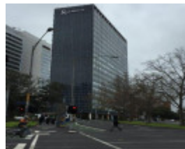
ICI HOUSE July 2016