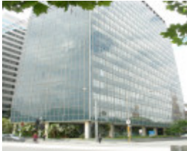
ICI HOUSE SOHE 2008