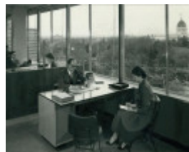
ICI House - An Interior Office 1958 Photo by Wolfgang Sievers.JPG