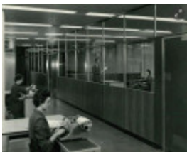
ICI Interior 1958.jpg