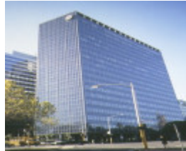
ICI House Nicholson Street East Melbourne Front Elevation