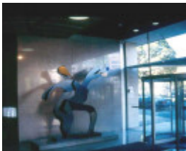
ICI House Nicholson Street East Melbourne Foyer Joie De Vivre