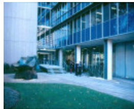
ICI House Nicholson Street East Melbourne Garden Entrance