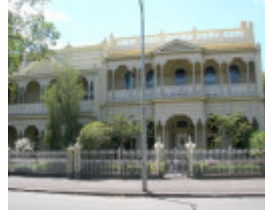
EASTCOURT SOHE 2008