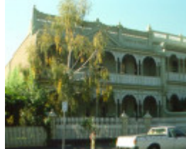
Eastcourt Street Facade May 2001