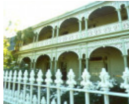
1 eastcourt h87 may 2001