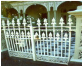
Eastcourt Front Gate May 2001