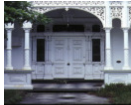
Eastcourt Powlett Street East Melbourne Detail Entrance