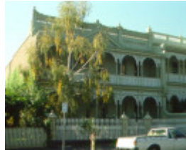
Eastcourt Street Facade May 2001