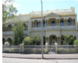
EASTCOURT SOHE 2008