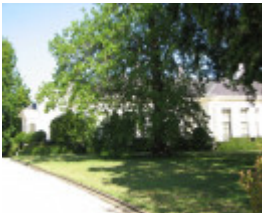
CRANLANA SOHE 2008