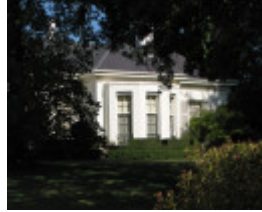
CRANLANA SOHE 2008