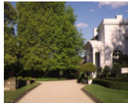
1 cranlana clendon road toorak drive & entrance