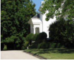
CRANLANA SOHE 2008