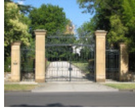
CRANLANA SOHE 2008